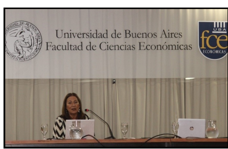
President and Delegate Fabiana Guglielmone welcomes attendees to the Argentina Affiliate's Food Safety Conference in Buenos Aires on 7 June 2019.