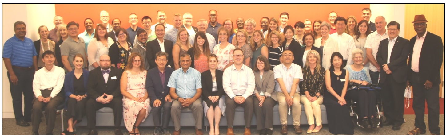
IAFP Affiliate Council Meeting, July 21, 2019.

uses Zoom, utilizes outside entity to manage their organization, flip calls; India uses Google Pro; Alabama uses Zoom for teleconference; Ohio uses its website and email; Minnesota uses its website, email and SurveyMonkey; technology used for recruiting members includes word of mouth and vendors who email to their customers; new food safety issues topics include mycotoxin, aflatoxin, pesticide residues, FSMA for exporters, developing key contacts at universities, poster competitions, drawing attention to university students; apps used include Join It, Apricot, Eventbrite and Hoover app platform for meetings and payments.